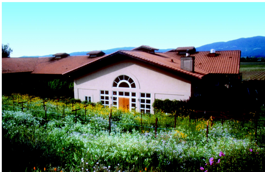
Below: ZD Winery and Tasting Room located on the Silverado Trail

Visit ZD's Tasting Room Open 10am - 4:30pm daily (800) 487-7757